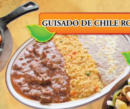
GUISADO DE CHILE ROJO