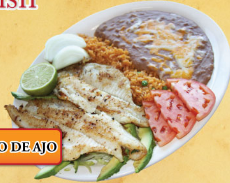
PESCADO AL MOJO DE AJO